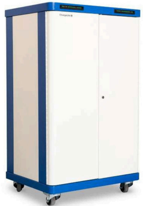
ChargeLite™ 32 USB-C Trolley

The power compartment has a separate lockable door, ensuring maximum safety and security.