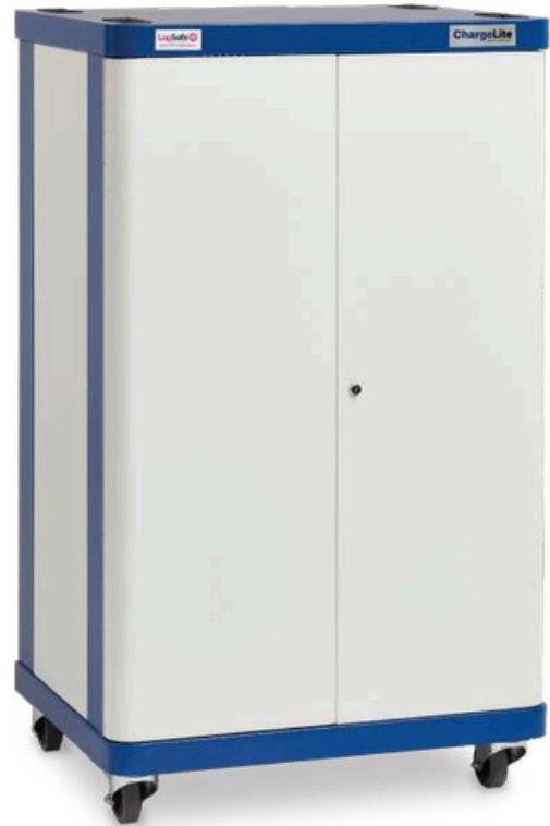
ChargeLite™ 32 fitted with key lock

The power compartment has a separate lockable door, ensuring maximum safety and security.