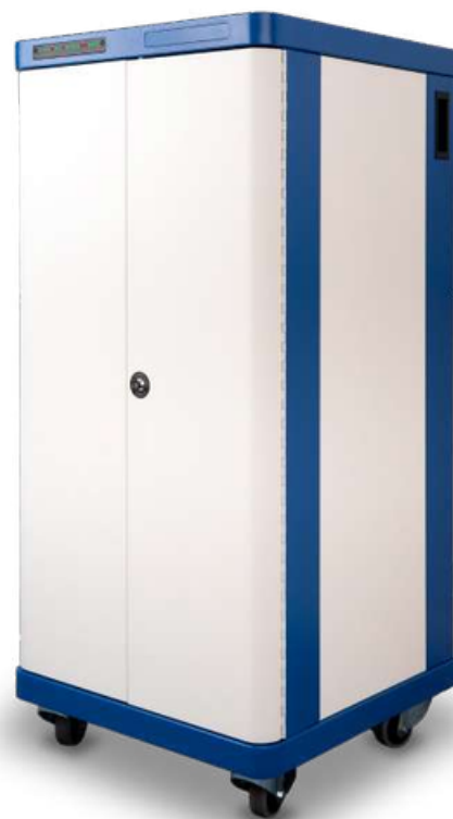
ChargeLite™ 16/32 USB-C Trolley fitted with optional PIN lock

The power compartment has a separate lockable door, ensuring maximum safety and security.