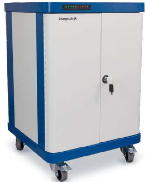
ChargeLite™ 10/20 USB-C Trolley fitted with key lock

The power compartment has a separate lockable door, ensuring maximum safety and security.