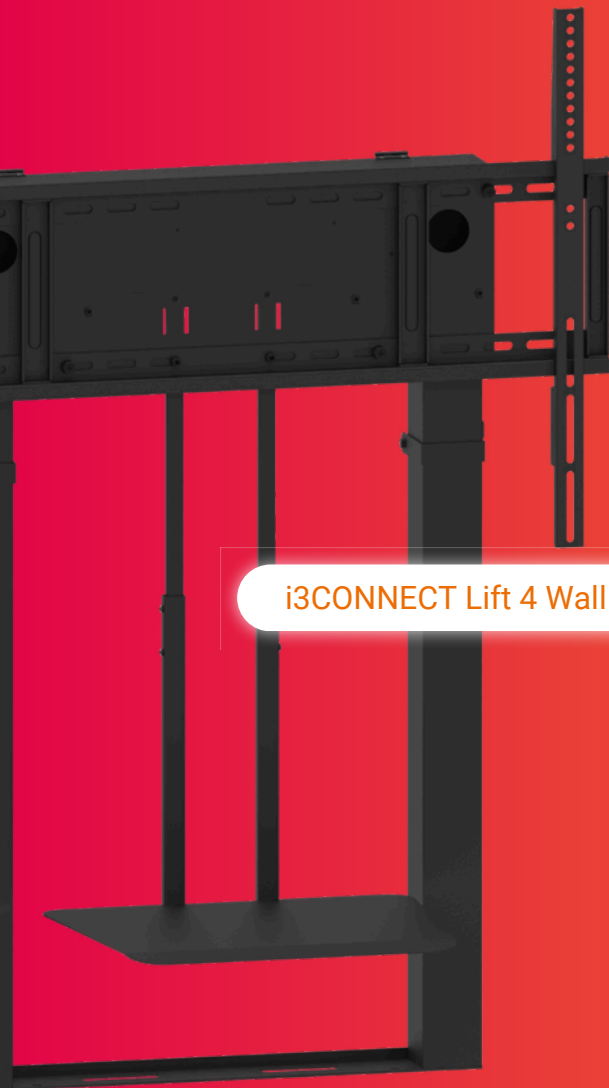
i3CONNECT Lift 4 Wall