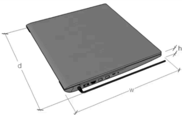
Back Power Connection