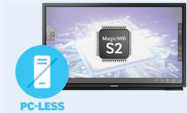
Figure 3. Embedded e-Board Solution that doesn't require a dedicated PC