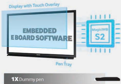
Figure 6. Packaged Offering of DME-BR