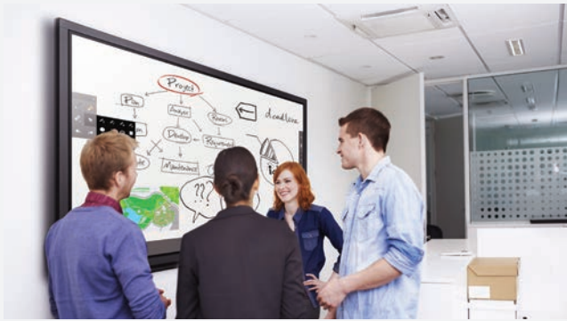
Figure 1. Increase productivity with interactive meetings