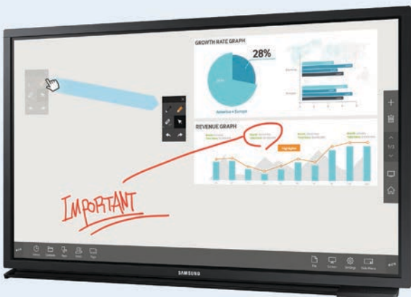
Figure 4. Feature for Easy Floating Menu and Draw on any Source