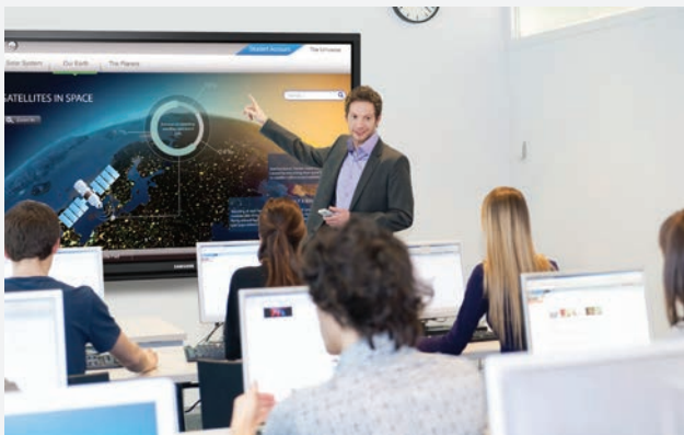
Figure 2. New lines of communication in the classroom

Gone are the days of educators needing to factor in the logistics of a typical projector system and the pitfalls and distractions that they come with. Samsung e-Board converts these past shortcomings into strengths through effective utilisation of FHD displays and interactive whiteboards. New lines of communication between teachers and students can now be forged, through data and file-sharing capabilities between the e-Board and devices of students, thus further creating an interactive presentation environment that holds attention spans and creates opportunity to diversify learning approaches. Samsung e-Board is well suited to help you convert your classroom into an intensive and engaging learning environment.