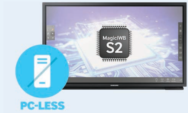
Figure 3. Embedded e-Board Solution that doesn't require a dedicated PC